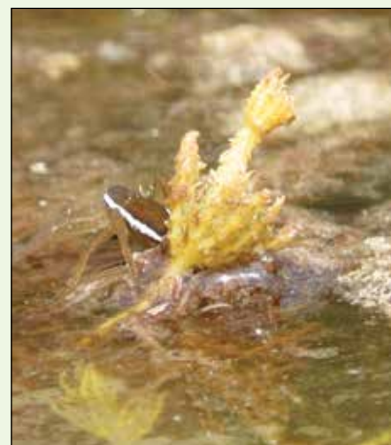
Fen raft spider

county. The trip is as much to see other wildlife as it is for birds and we weren't disappointed seeing bountiful butterflies, dragonflies and damselflies as well as a special species for the reserve – Fen Raft Spider. We encountered a few bird species such as Marsh Harrier and Grey Heron but now we look forward to our autumn field trips for migrant birds.