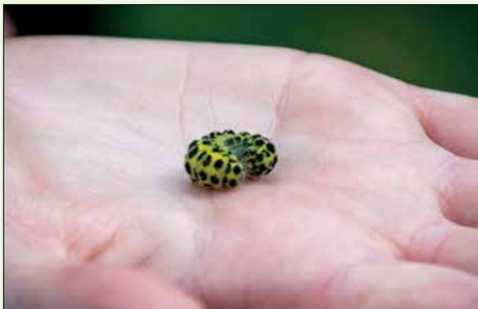
Any ideas what caterpillar this is?