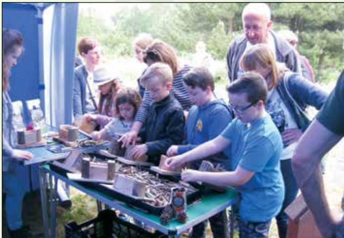
Over 300 visitors to our stand at the Suffolk Show

Back in May we had a great opportunity to reach a massive audience at the Suffolk Show. Invited by Suffolk Wildlife Trust into their wildlife area for the second year, we received a terrific response to our Wildlife Homes project, helping over 300 visitors to make and take home boxes for birds, bugs and hedgehogs. All thanks to the Greenways and IWG volunteers who manned the stand.