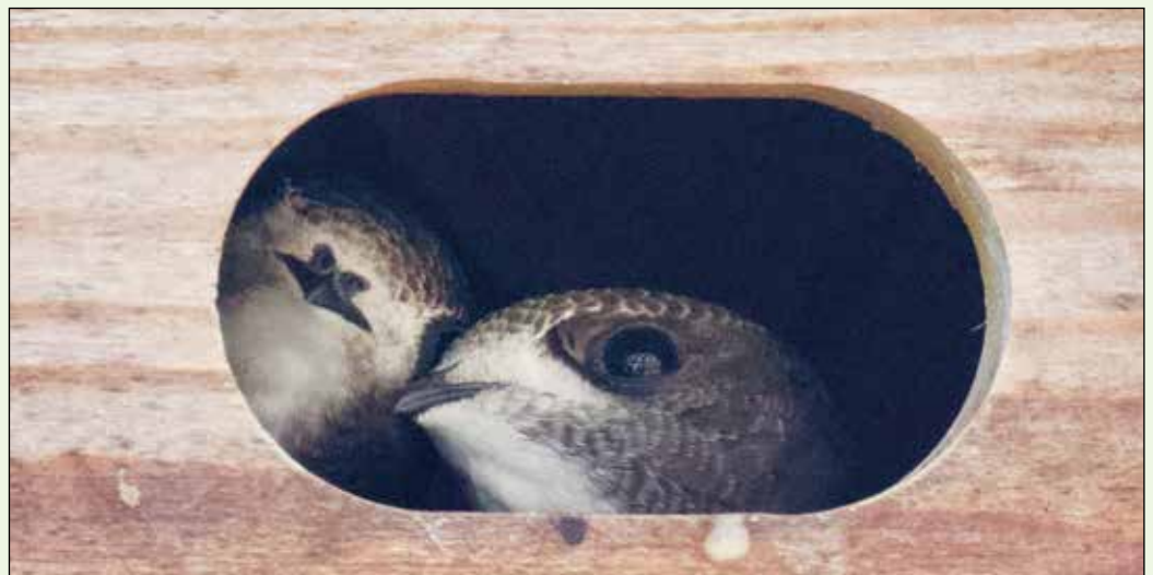
Young swift siblings look out at the world

All the conservation organisations working together to inspire local people to help wildlife throughout the town and beyond. www.wildipswich.org