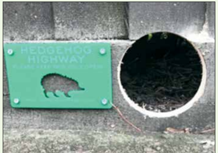
Barnes hedgehogs offer drilling days – these are examples of the holes created. The first 50 holes made in Ipswich will receive a free Hedgehog Highway plaque.

Will you let us make a hedgehog-sized hole in your garden fence, gate or wall? We have drills available that can make holes in walls and fences, for creating Hedgehog Highways. Hedgehog Champions provide free drilling days in their local neighbourhoods! They invite neighbours to book an appointment using our postcards. Would you like