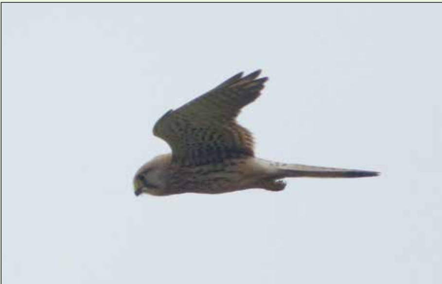
Excellent views of a Kestrel hunting

After a very successful, interesting and long day we headed home to Ipswich.