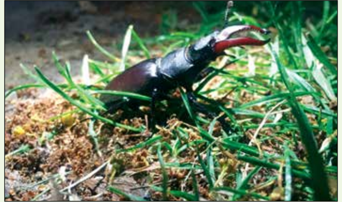
More data for the PTES Stag beetle survey

One way was to take part in The Wildlife Trusts national campaign '30 Days Wild', a month long nature challenge asking people to do something wild every day in June. We started with a night safari in Holywells Park with pipistrelle bats and tawny owls. Our adventures have taken us to Pipers Vale, teeming with stag beetles and Purdis Heath to