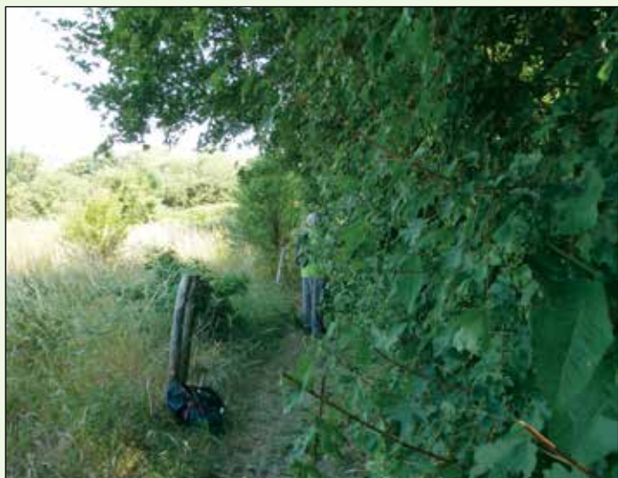
Our nine volunteers tackled the woodland path...

Friends of Belstead Brook Park (FoBBP) was set up in 2002 to help look after the 250 acres of informal country park on the south-western fringe of Ipswich. The group runs practical work parties, helps raise funds for improvements and acts as 'eyes and ears', passing information back to the Greenways Project.