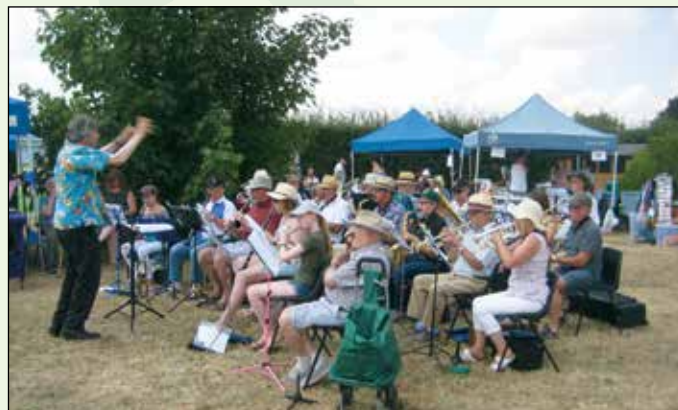
The Maidenhall Big Garden Party in full swing

Our involvement is bringing our Wildlife Homes activities to visitors and this year we had considerable competition from other attractions including, a drumming workshop, story telling (with