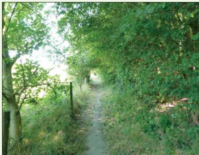
...and what an improvement!