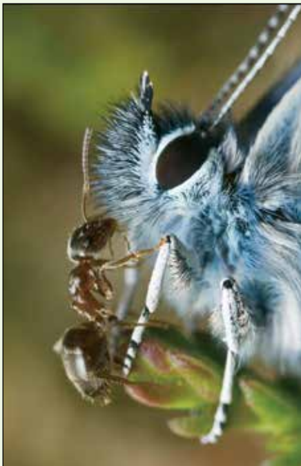
Silver studded blues and ants have a special relationship