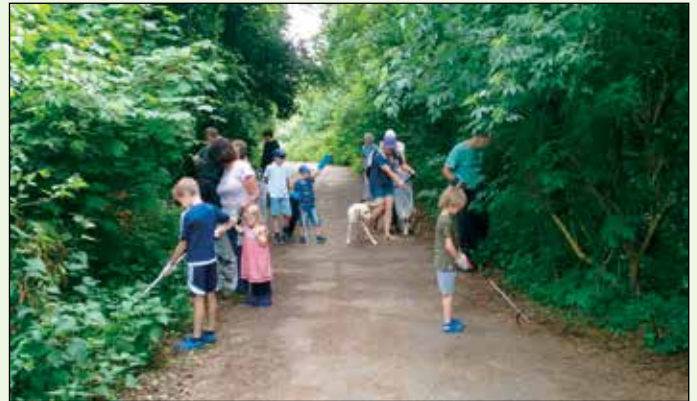
Litter pickers in action

We held a litter pick on the 27th May, 14 people scoured the woods for the smallest