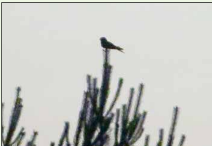
Nightjar in evening silhouette

Recently I was volunteering at Minsmere during the rainy, windy interval to the heatwave, and the swift passage, forced low by the inclement weather, numbered in the hundreds. And they were all heading south; swifts stay with us between early May and early August, and they are among the earliest departing species. Combining that with the migratory wading birds already on their way south from the high Arctic is a sure sign that Autumn is on the way.