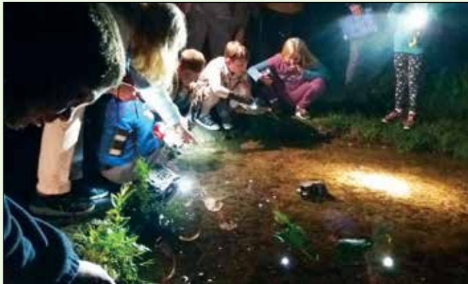
A glow worm hunt

search for glow worms, then to Chantry park to climb a cedar tree and to the river in town to ogle at gooseberry and moon jellyfish.