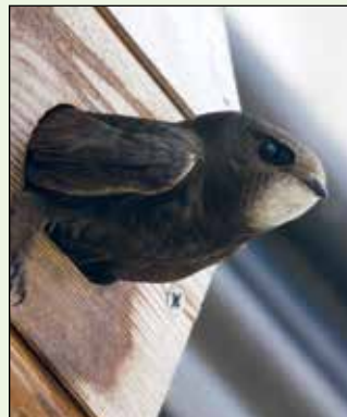
One of the Ipswich boxes in use