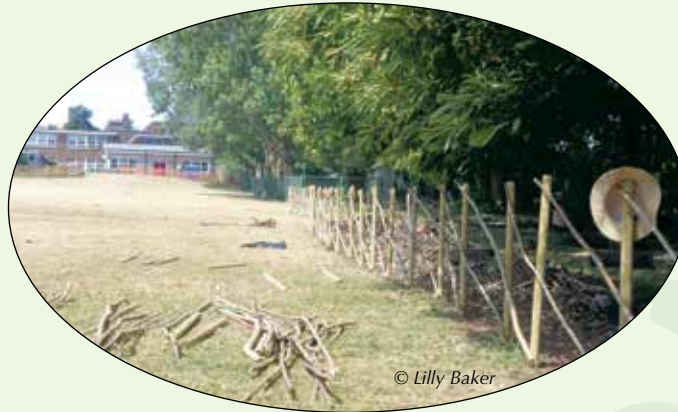
Hazel fence under construction at Hillside School

For the past five years we have been invited to be part of the Big Garden Party at Maidenhall Allotments and