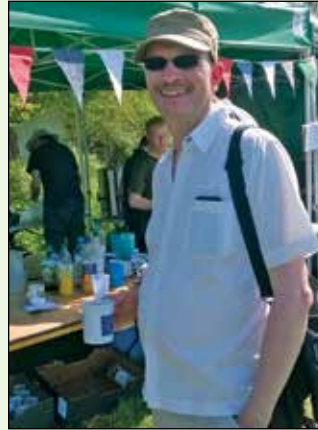
Ipswich MP Sandy Martin was a visitor to Spring Wood Day showing his support for the work of Greenways and local conservation groups.

The 'Planet Suffolk' River clean up event with BBC Radio Suffolk was also very popular with around 70 local people turning out to help clear up parts of the River Gipping path and banks through the town. Divers from Diveline managed to pull out 36 shopping trolleys and 25 bikes from beneath the water, along with countless road cones and two safes – both cut open! In addition, almost a full skip of general litter and rubbish was collected and removed.