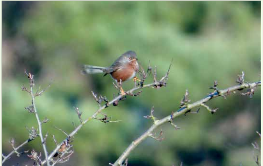
Dartford Warblers were in danger from heath fires

Here in Ipswich we live in one of the driest and sunniest parts of the country, and it is often said that there are parts of the Negev Desert in Israel that see more rain than we do. I must get round to checking the veracity of that particular fact one day, but for now it will do as an indication of just how dry Suffolk, and East Anglia in general, actually is. It's always important to provide fresh water for our avian friends, but particularly so when the mercury hits the mid-thirties degrees Celsius as it has done