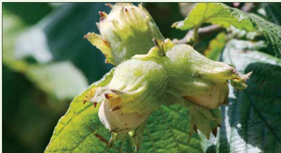
Green cobnuts on the tree

to consideration, nor has any structured amelioration been proposed. In late news, Suffolk County Council have temporarily paused the project whilst the likely costs are reviewed.