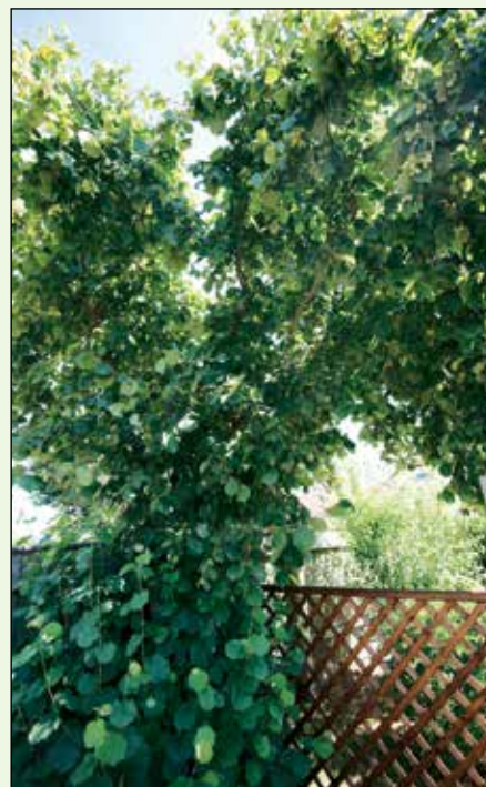
Cobnut tree in domestic garden

Meanwhile, the Friends have been contemplating the environmental, conservation, and heritage issues associated with the proposed Upper Orwell Crossings and the impact of the proposed schemes upon Holywells Park and its surroundings, and especially the full river crossing. Besides the likely visual impact of the bridge structure as seen from Holywells Park, there would be direct impacts from local pollution by noise, vibration, light, noxious gases and particulates. To date, the planning process seems not to have taken these concerns in