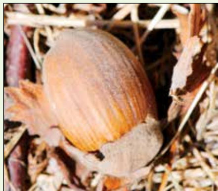
Hazelnut or possibly cobnut

Traditionally, a Suffolk farm orchard would be likely to be associated with a small number of cobnut trees, grown as a cash crop. According to the Kentish Cobnuts Association, just before the First World War in the UK there were over 7,000 acres (nine square miles, 28 square kilometres) of cobnut plats under cultivation. By the middle of the 20th century, that had dropped to 730 acres (about a square mile, three square kilometres) and by 1990 a mere 250 acres (a third of a square mile, about one square kilometre) remained. The