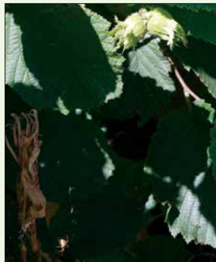
Wild hazel hedge, planted, showing nuts and spider